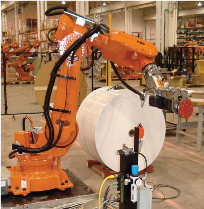
Robotic Roll Finishing System: ABB Robot and ATI Force/Torque Sensor