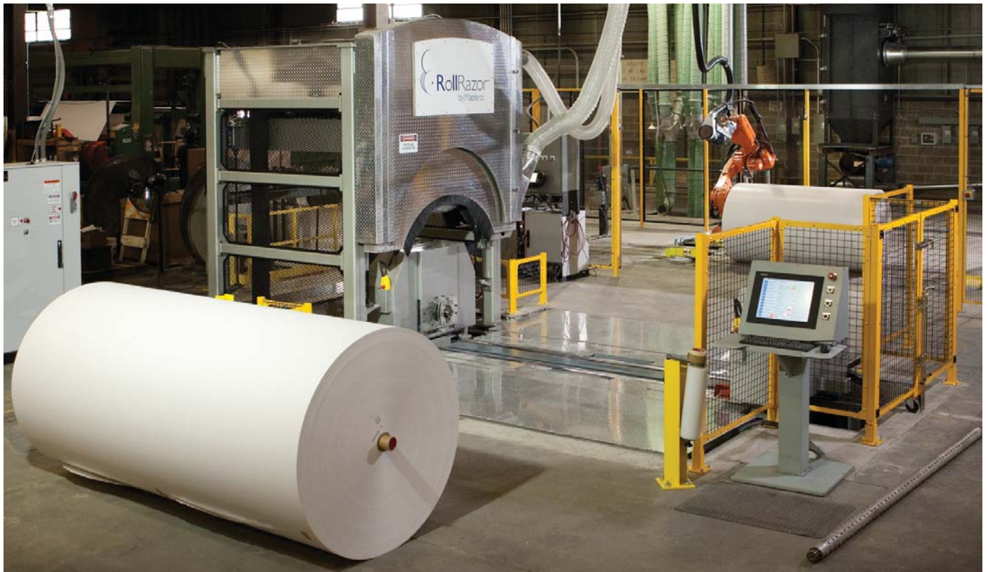
The Norkol system combines RollRazor cutting technology with an ABB Robot and ATI Force/Torque Transducer