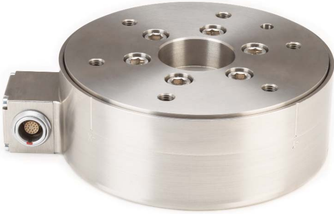
ATI Multi-Axis Force/Torque Transducer