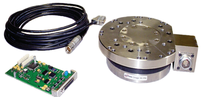
Interface Board, cable and Force/Torque Transducer

Perry elaborates that ATI's Force/Torque Sensors are largely immune to crosstalk. Load cells typically measure just one or two axes of loading, which can unintentionally react to loads on other axes, resulting in undesirable crosstalk. Six-degree of freedom transducers don't have this type of crosstalk problem. Another advantage with the ATI sensors is the availability of connecting to a wide range of industrial interfacing options including Ethernet, EtherNet/IP, USB, PCI bus, PCMCIA, RS-232, analog voltage, and more. The sensors come as a complete system making it simple for the customer to connect to their equipment. Load cells, which usually only use analog voltages, have only one or two ways of connecting, requiring external electronics bought separately. Finally, and perhaps most importantly, Perry adds that load cells can only withstand 150% to 200% of an axis's rated range increasing the chances of it failing where force/torque sensors' overload capacities generally run from 5 times to greater than 20 times depending on the selected calibration.